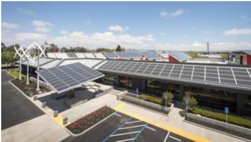
ZNE Center, San Leandro