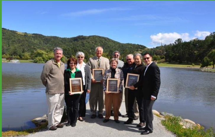
Sustainability Pioneer Award from Marin Builders Association