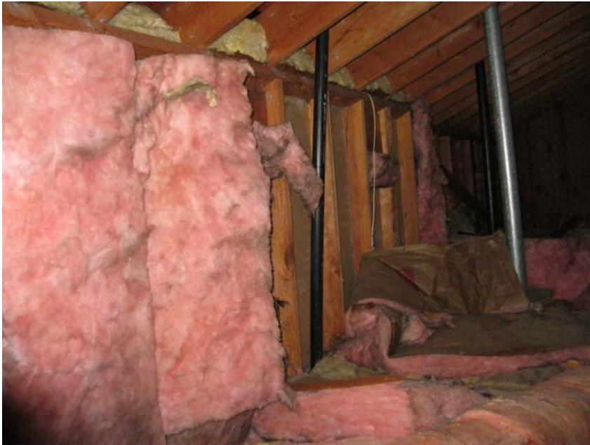
Improper knee wall insulation

The image cannot be displayed. Your computer may not have enough memory to open the image, or the image may have been corrupted. Restart your computer, and then open the file again. If the red x still appears, you may have to delete the image and then insert it again.