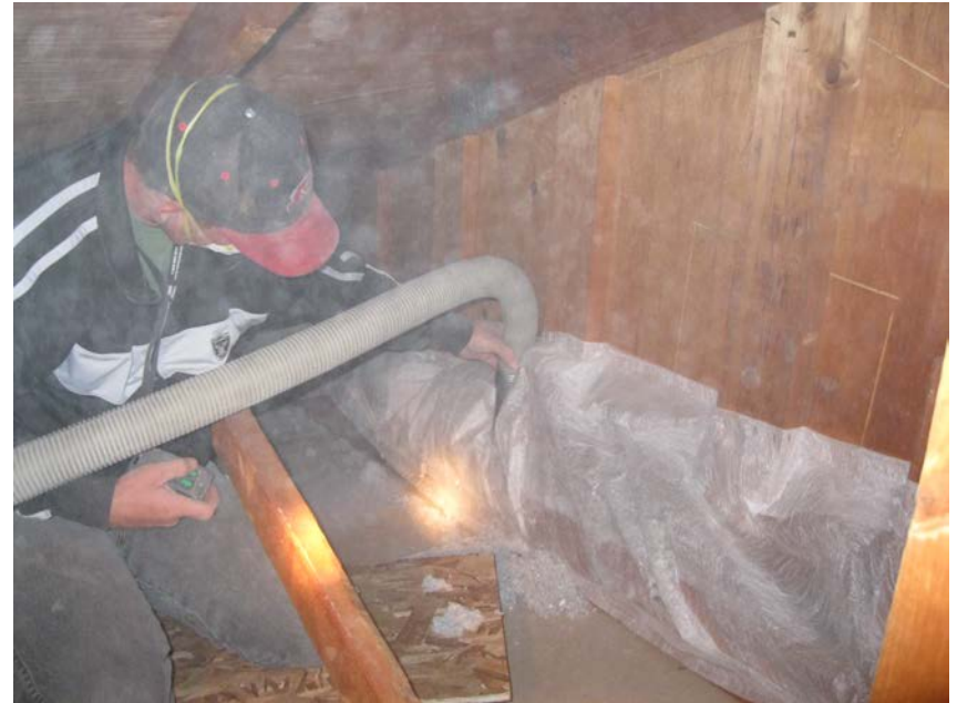
Blowing in new insulation