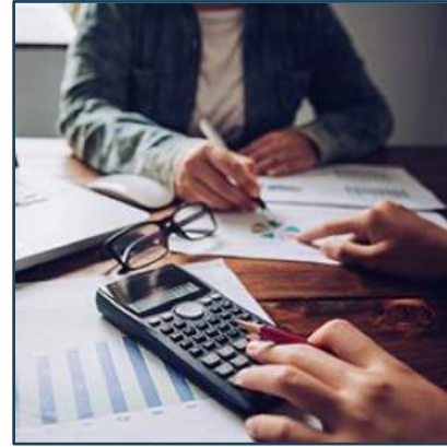
Revolving Loan Fund