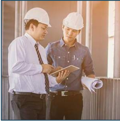
Project Delivery Program