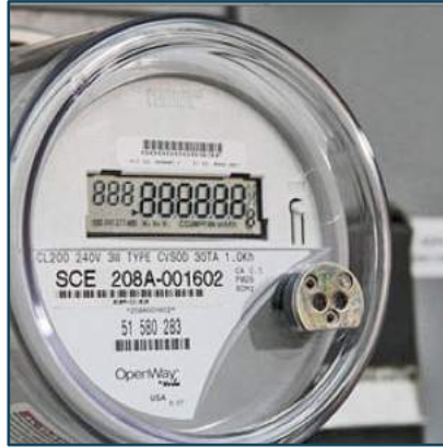
Metered Savings Program