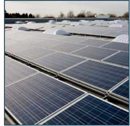
Pathway to Zero