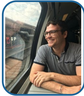
Lawrence Garber Building Decarbonization Coalition