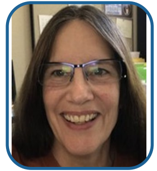
Misti Bruceri Local Energy Codes