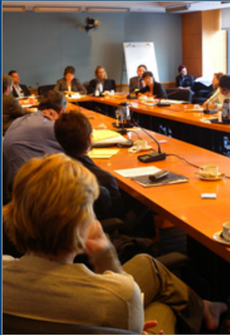
Retrofit Advisory Council