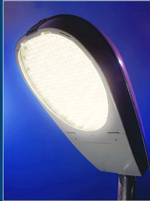
Adaptive SL Controls Demo