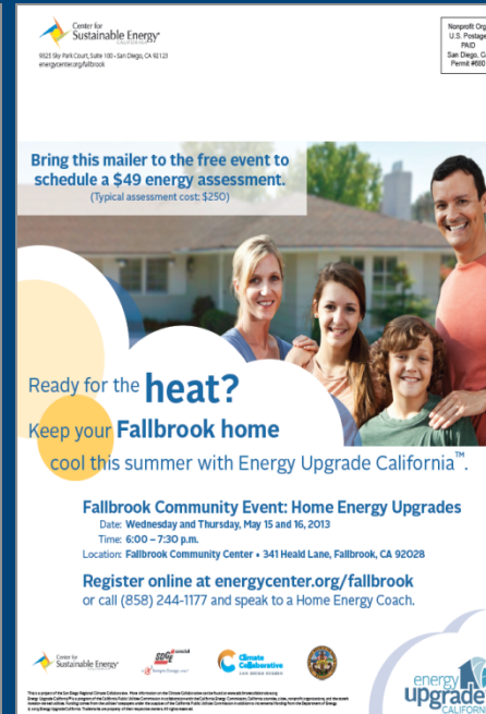
Events & Demo Homes