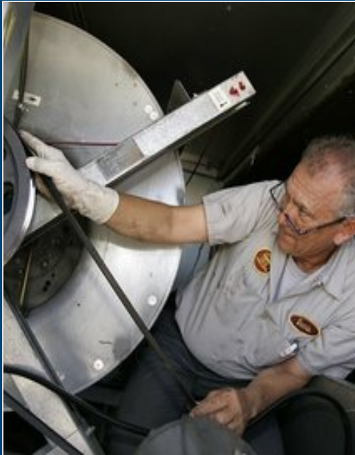
Joint Procurement Working Group