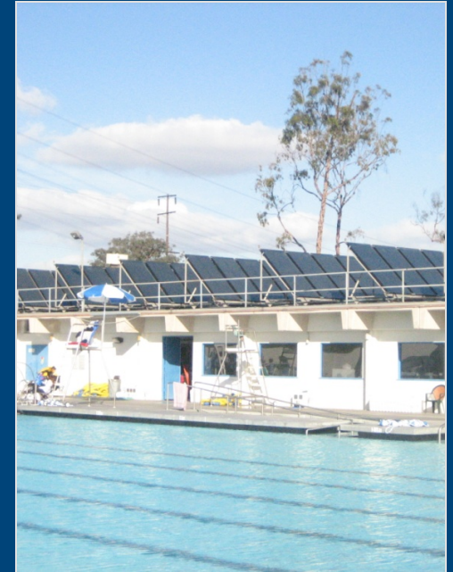
Pool Pumps & Other Water/ Energy Projects

Implementation Partner: CleanTECH San Diego