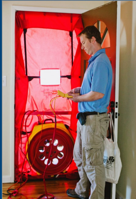
HERS Rebate Pilot