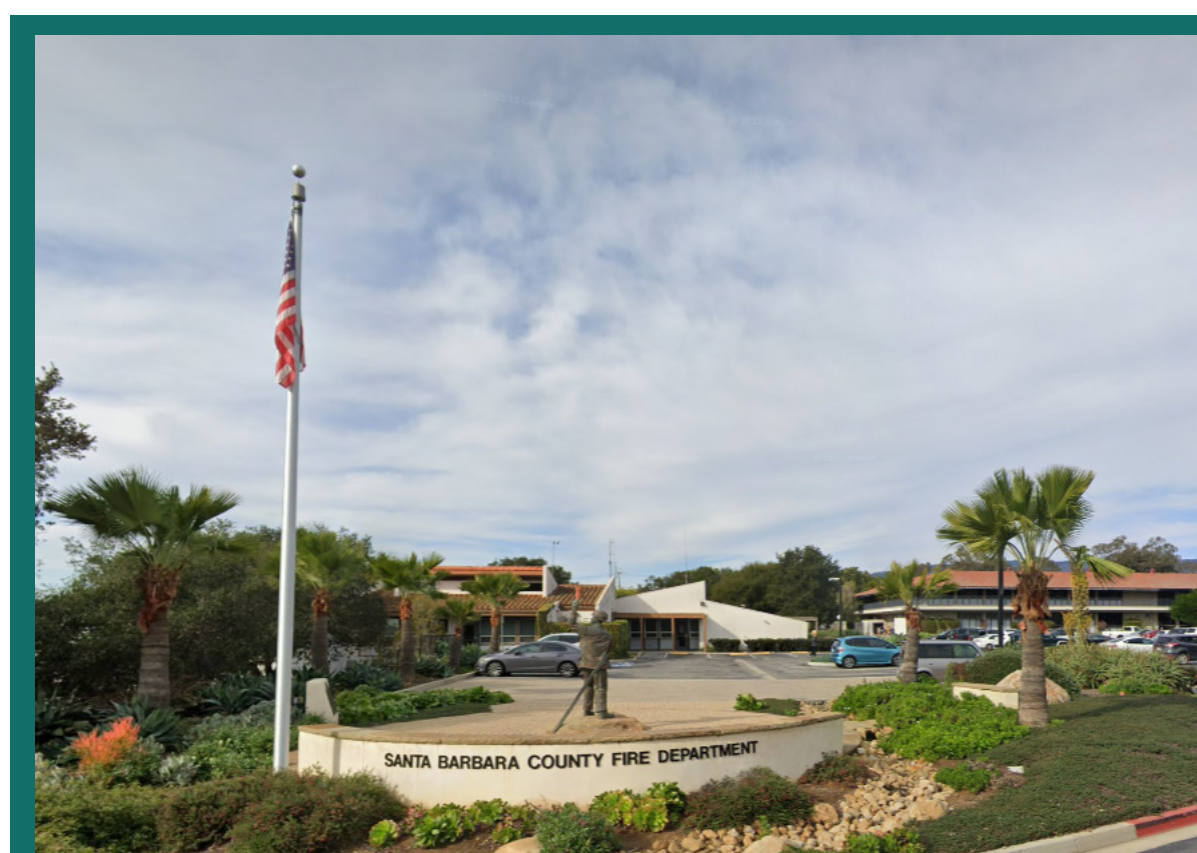
Fire Department Headquarters 12 LED fixtures replaced on the exterior of the building.