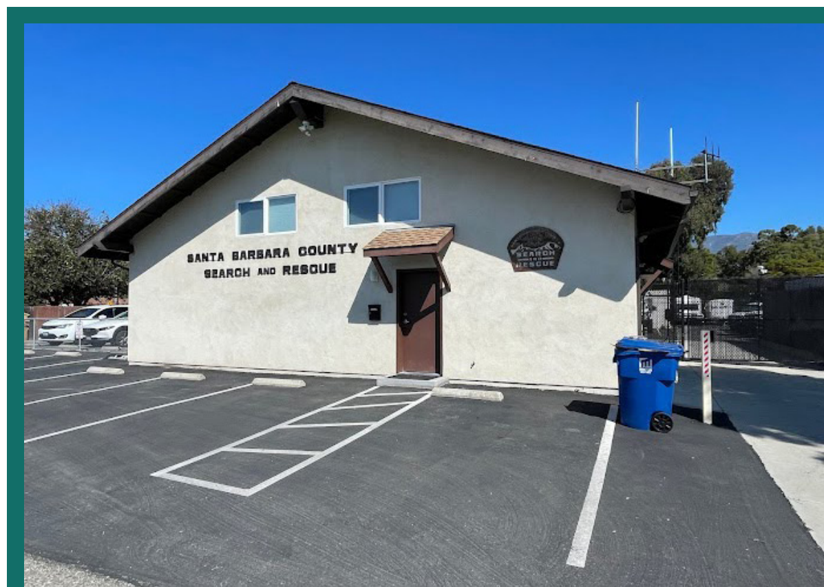
Santa Barbara County Search and Rescue 26 LED fixtures replaced in the parking lot.