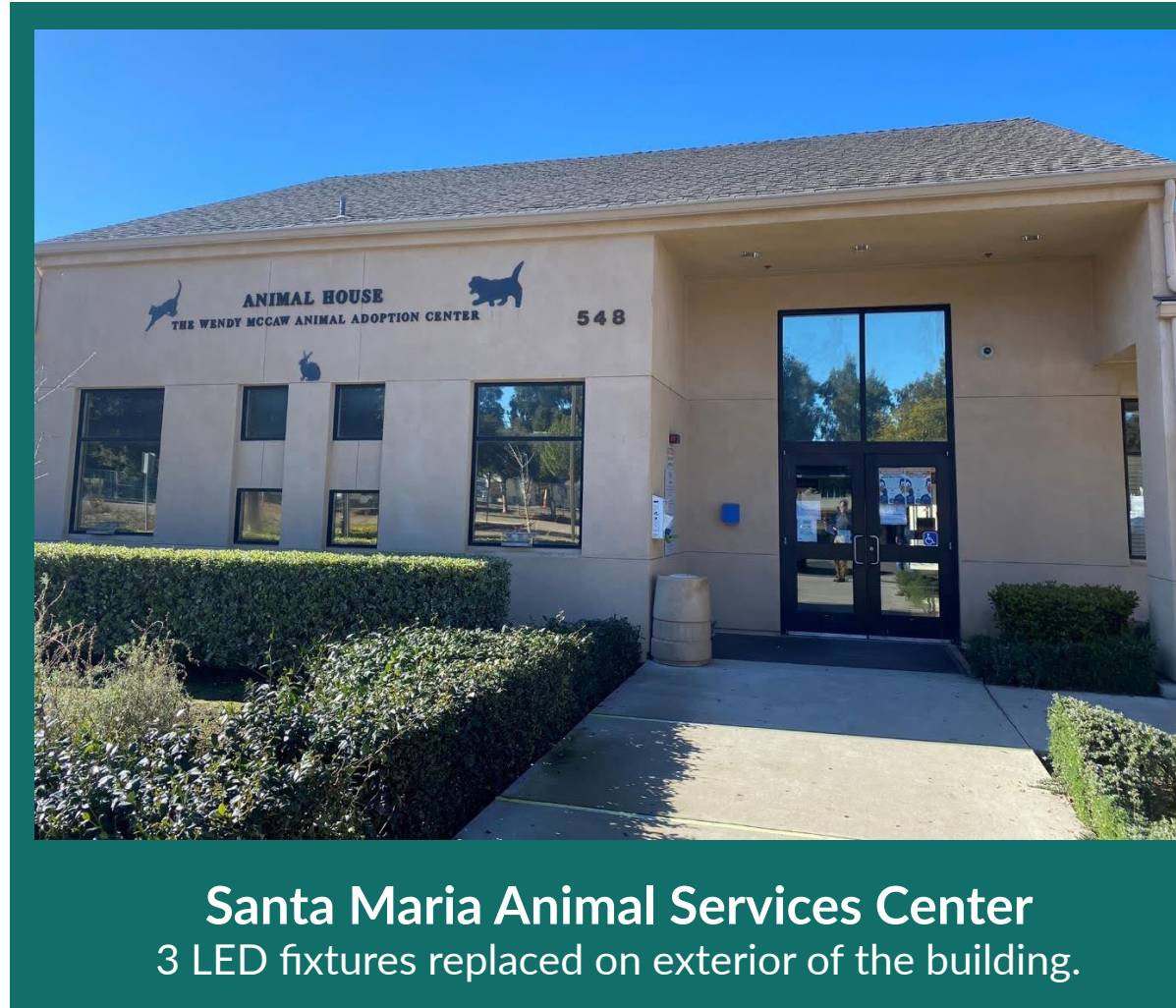
Santa Maria Animal Services Center 3 LED fixtures replaced on exterior of the building.