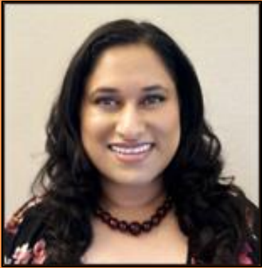
Sona Coffee Senior Program Manager